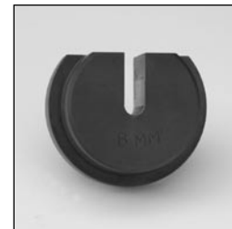
Fig. S110 — Nut Die

Dimensions and pressures for reference only, subject to change.