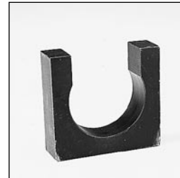
Fig. S108 — Back up Plate