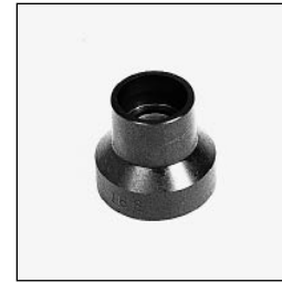
Fig. S107 — Body Die